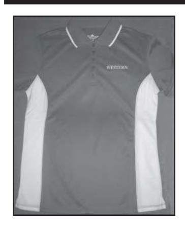
Ladies Polo: Colorblocked, wicking, royal blue and white, white embroidered Western, SM-2XL $32