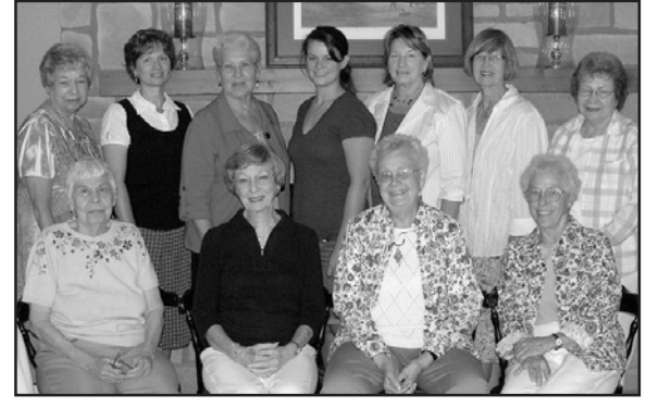
July 20: Southwest Ohio, at Oxford Country Club