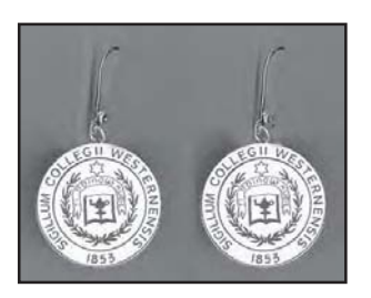
Earrings: 3/4" inch round dangle earrings, laser enamel, royal blue college seal on white background with silver finish $15