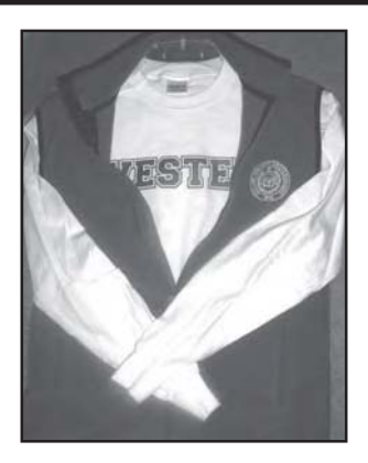
Long Sleeve T-shirt: Gildan, ultra cotton, white with navy imprint, SM-2XL $15

Microfleece Vest: full zip, royal blue with black accent tipping and white embroidered college seal, XS-2XL $35