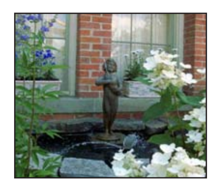
See you June 17-19, 2011, for Spotlight Western! (Information on Alumnae Service Award nomination, p. 45)

NEW at our June '11 Reunion: SILENT AUCTION and SHOWCASE WESTERN We need YOU to be a BIG part of both!