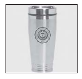
Stainless Tumbler: 16 oz. double wall stainless with royal blue college seal imprint $15

Gifts for all occasions ... just a select few of the many Western items available at irresistible prices.