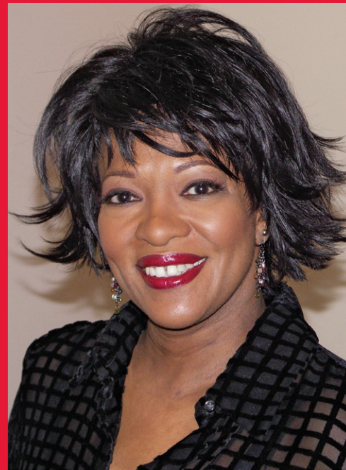
Rita Dove, '73