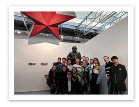
Fall 2018 students at the Museum of Communism

The highlight of the semester was a trip to Prague to study the transition from a socialist economy to a thriving member of the EU. Students heard about their issues with simultaneously low unemployment and low wages, a recent episode of inflation, and the tensions between the business community's desire to adopt the Euro and the resistance among a majority of the citizens. We contrasted the communist past at the Museum of Communism with the innovation going on today at Skoda Auto's Digilab.