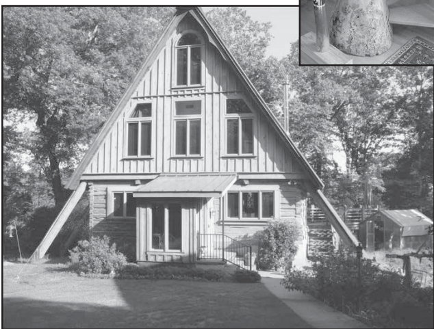
The Baileys' Chateau, with the first Lord & Burnham greenhouse visible at the right rear. Inset: Base of the two-story spiral staircase which Earl made. The center piece is a red oak tree from their property.

could be repaired. Our redundant outside and inside wood heaters had to be loaded with wood all times of the day and night. Imagine us in 20-degree weather, wearing coats and gloves over our pajamas, holding flashlights and loading a big outside furnace. We saved the orchids!